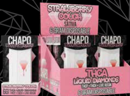
STRAWBERRY COUGH SATIVA