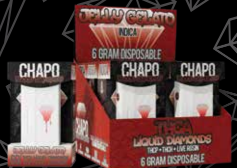
JELLY GELATO INDICA