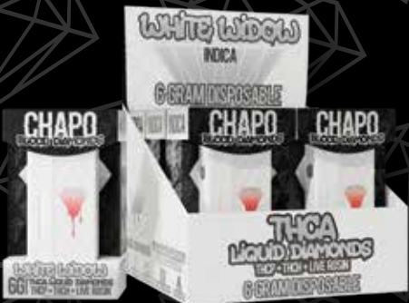
WHITE WIDOW INDICA