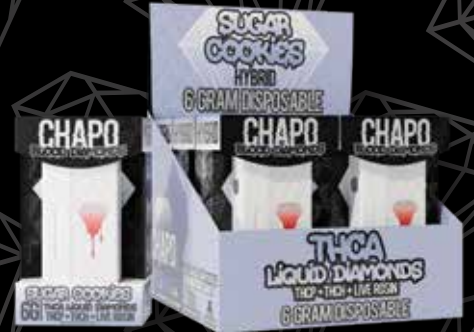
SUGAR COOKIES HYBRID