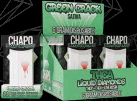
GREEN CRACK SATIVA